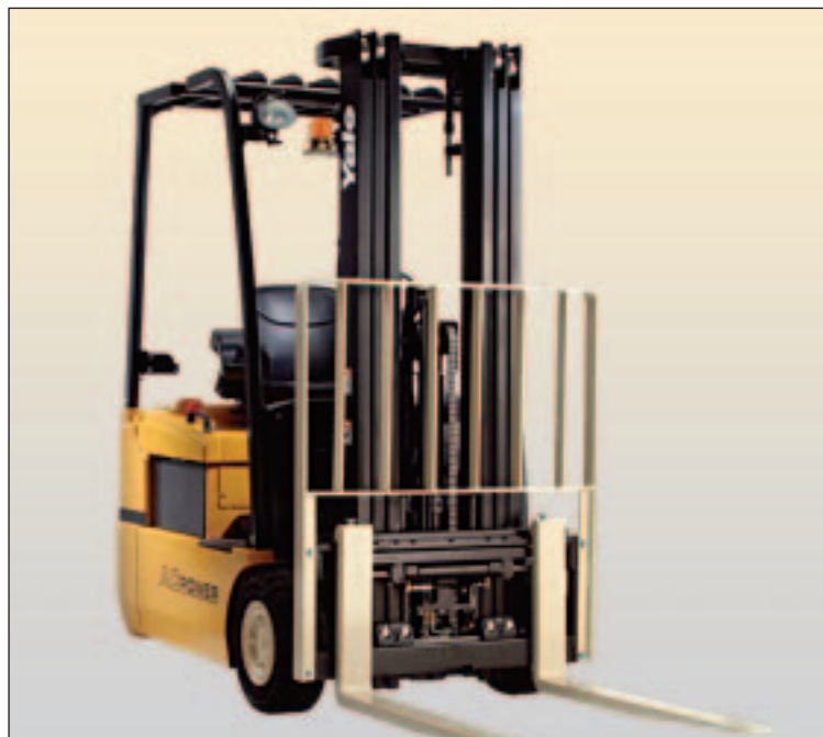
Truck shown with optional equipment